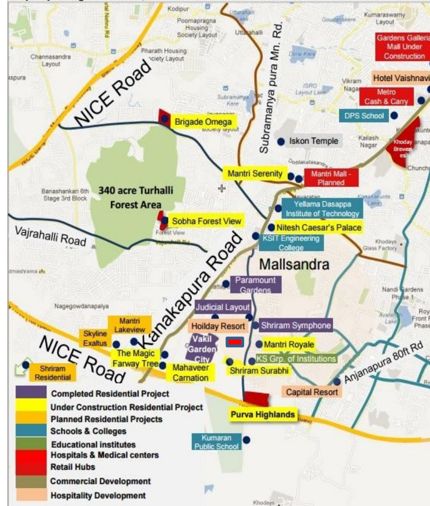
Map capturing residential, commercial & social infrastructure in the micro-market